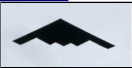
Above: Is it a bird? Is it a plane? Is it Superman? Yep, it is a plane in the fly-over!!