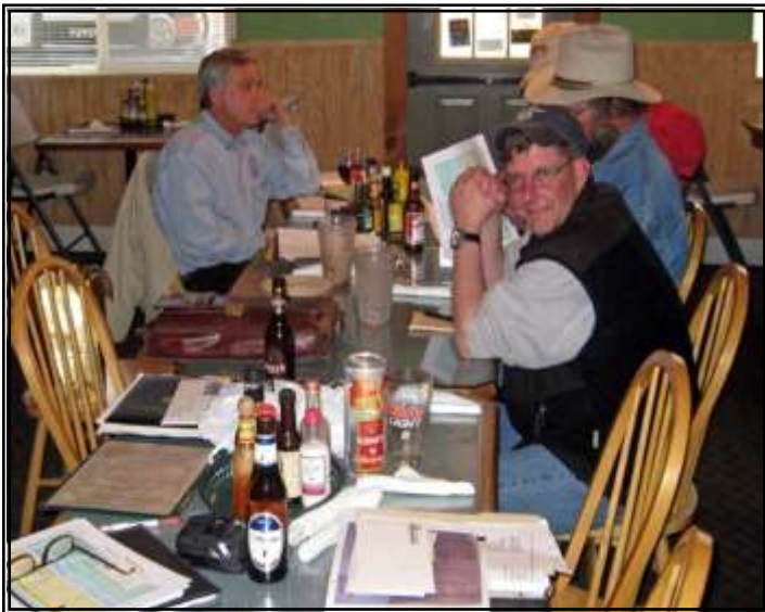
An Executive Committee meeting at the Crystola.