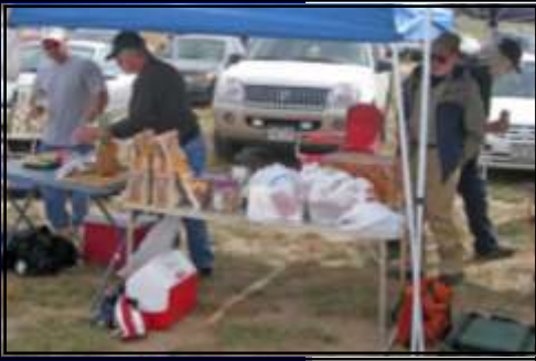
Above: A little food and beverage before the game made for