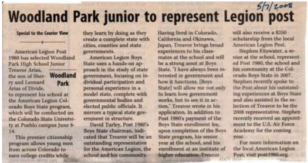
Article from the Pikes Peak Courier View, May 7, 2008