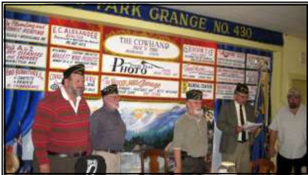
Photos: Post 1980 Officer Installation, June 2008.

Officers. In accordance with the by-laws and constitution new or continuing officers were nominated, elected, and installed in April-June 2008 (see listing above). The Post 1980 members give their sincere thanks to these officers who served this Post in these critical roles in 2007 and 2008.