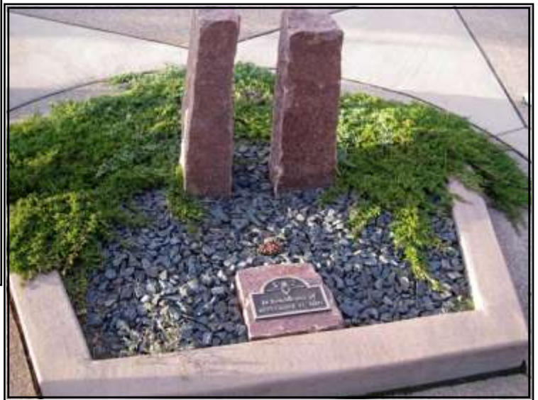
9-11 Memorial at Lions Park in Woodland Park at CO67-US24 intersection.