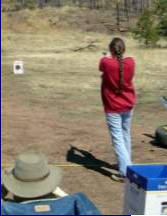
Above: Taking aim!!!