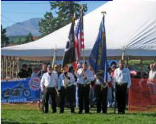
Above: Honor Guard at the Woodland Park Motorcycle Rally, August 2008. Right: Flag installation at Lions Park.

Post 1980, often with members of VFW Post 6051, formed the Honor Guard for a number of Woodland Park events in 2008. Memorial Day, Independence Day, Woodland Park Motorcycle Rally, and the Woodland Park Christmas Parade — the Legion was there to lead the way and present the Colors. Likewise Post 1980 and VFW Post 6051 joined together to raise the flags at the Lions' Park at the intersection of CO67 and US24 for Independence Day, the Woodland Park Motorcycle Rally (Protecting the American Dream), 9-11, and Veterans Day.