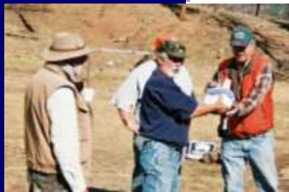
Above: First place — a turkey!