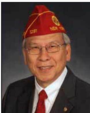
National Commander Fang A. Wong

Founders of The American Legion understood exactly what they had by the first national convention. Less than eight months after the idea for a new association of wartime veterans was first proposed, Legion membership had ballooned to 684,000 and growing. More than 5,000 posts had sprung up in towns and cities from coast to coast by November 1919. A union of patriots was suddenly sewn into the fabric of the nation, poised to become a major influence over local, state and national politics. The founders, as well as the politicians, realized that the Legion could lobby everywhere at once, and in great numbers.