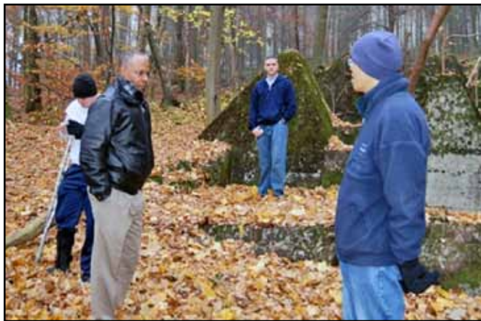
Wounded servicemembers recovering at Landstuhl Regional Medical Center tour a German battlefield on a Legion-sponsored retreat.

A little weary by the end of the day, the servicemembers of Landstuhl’s Medical Transcient Detachment offered positive reviews of their adventure.